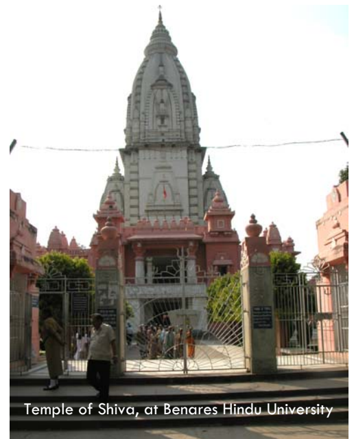
Temple of Shiva, at Benares Hindu University