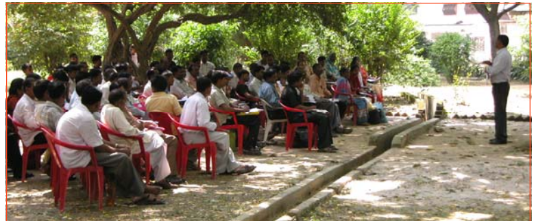
An Indian leader is teaching church planters about persecution, which they can certainly anticipate. Uttar Pradesh is less than 2% Christian.