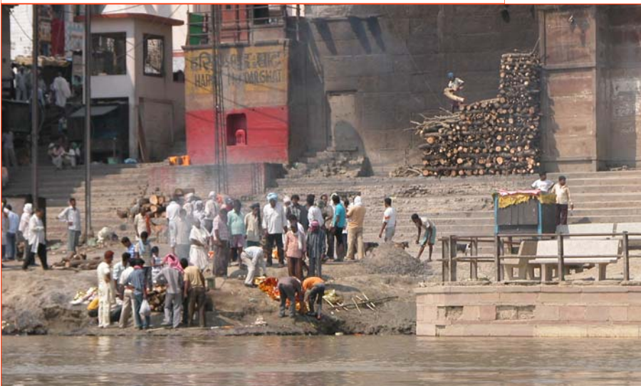
A cremation site on the Ganges at Varanasi (Benares). It's believed that if a Hindu is cremated here and the ashes put into the Ganges, the bad karma (deeds) of 1,000 lifetimes is undone.