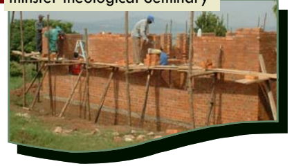
Dorm construction, Westminster theological Seminary