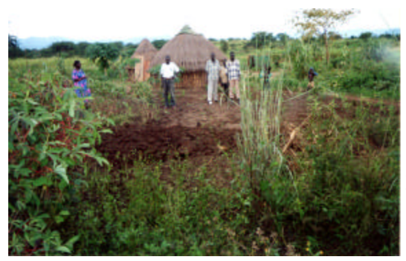
Bomb that fell from Antonov bomber at night on 10/13/2000

In three passes over the small bush town, they dropped five antipersonnel bombs. They killed or maimed civilians, many of them patients in the hospital, others in the marketplace, others in a feeding center for the starving. All of these were known civilian centers and all were intentionally