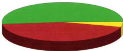
« 2000 Income 2000 Expenses »

Administration: Finances: All financials handled, including donations Media: Major website upgrade (averaging over 275 visits/week); created CD ministry display; produced monthly newsletters and a tri-fold brochure; Other: monthly ministry reports to Board, 4 Board meetings; federal and state documents filed; completed supporting church reports