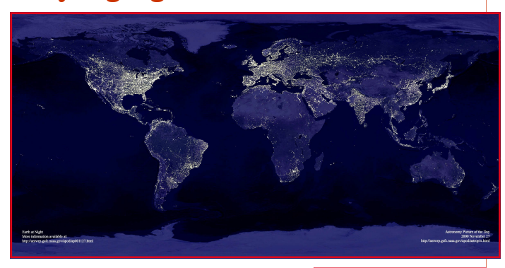
The Earth at night

for 165 class hours. Taught AfAm missions seminar for 52 class hours.