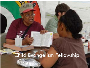
Child Evangelism Fellowship