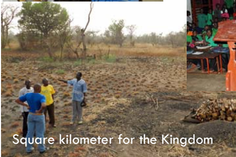
Square kilometer for the Kingdom

We plan two S. Sudan trips in 2013—to the Juba area in February and to the Torit area in July. We need teachers, evangelists, medical personnel, builders, networkers, etc. Contact us soon if interested. www.rmni.org/global-and-short-term-missions/sudan.html