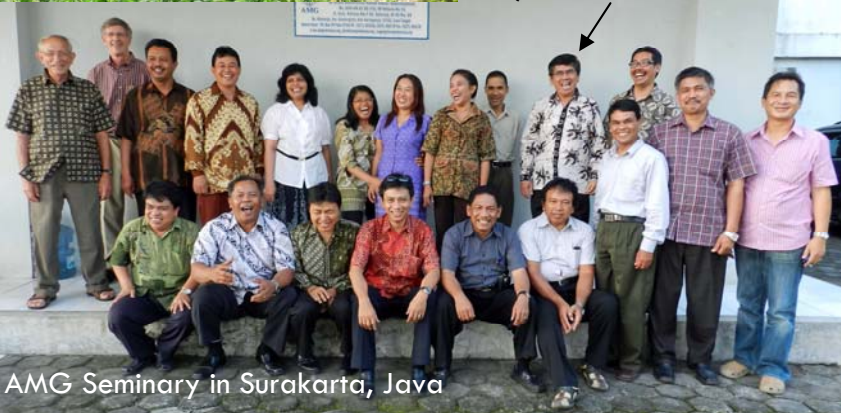
AMG Seminary in Surakarta, Java