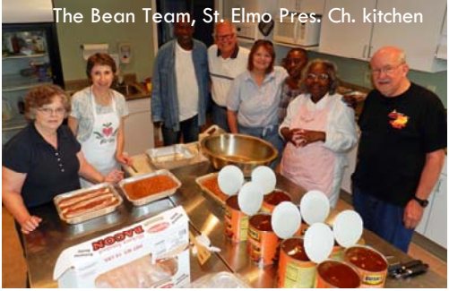
The Bean Team, St. Elmo Pres. Ch. kitchen