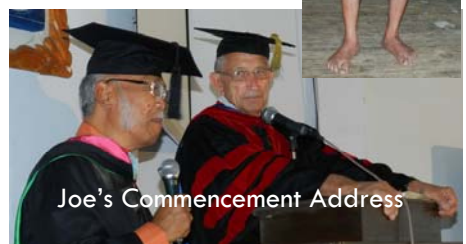
Joe's Commencement Address