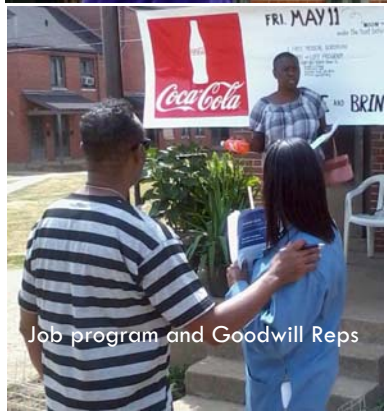
Job program and Goodwill Reps