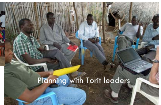
Planning with Torit leaders