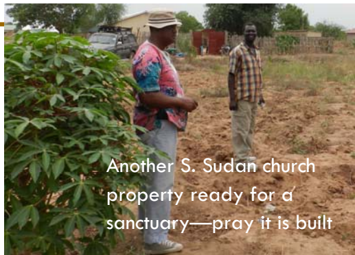
Another S. Sudan church property ready for a sanctuary—pray it is built