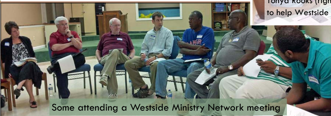
Some attending a Westside Ministry Network meeting